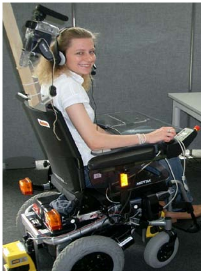
Figure 1. The autonomous wheelchair Rolland

The comparability and control of the situation is achieved by keeping the robot behavior constant. That is, the robot's verbal output is based on a script which is the same for all dialogs. The robot's utterances were played according to a fixed schema by the human wizard behind the scene. In a pre-study, typical locations,