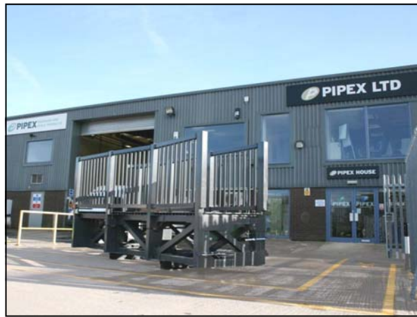
First Section: Outside Pipex Factory)