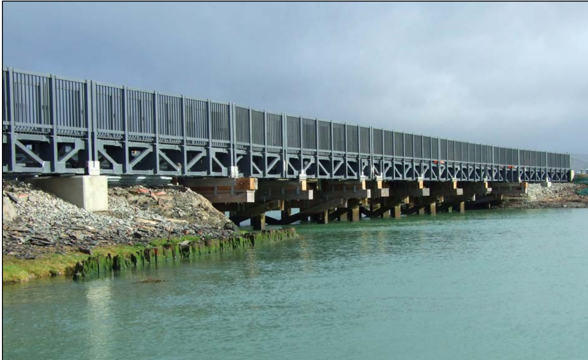
Leri footbridge installed over the River Leri

Project FRP Footbridge to cross the River Leri