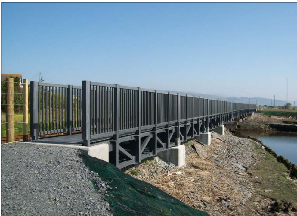
Leri Footbridge installed