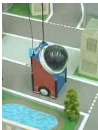
Figure 2: The robot is built on a 8cm x 8cm base. Its wireless color video camera sends images to a PC for processing, and the PC send motion commands by radio to the robot.

correspond to simple procedures to program, but they are needed to allow the user to speak without special training.