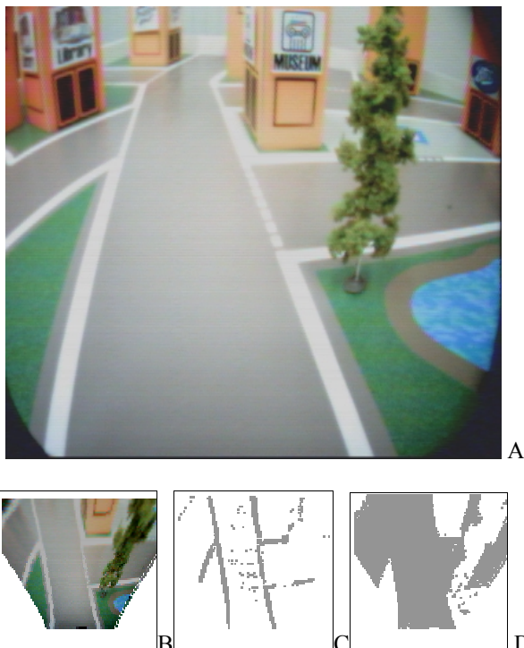
Figure 3. B: Top view obtained from a perspective transform of A. C: Extracted road edges. D: Extracted road surface areas.

Two versions of the short-lived map are currently used, the first represents the position of the road surface and the second represents the position of road edges. These maps are constructed using road surface and road edge information filtered out from the top view of the scene. This view is produced by applying a perspective transform to the camera image. Figures 3B show the top view of 3A, and 3C and 3D show the extracted road edge image and road surface image respectively.